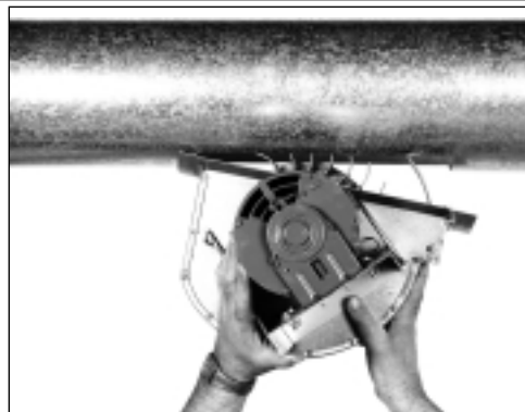
In-line Draft Inducers are easily installed inside vent pipe.