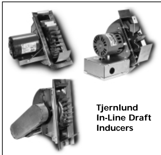
Tjernlund In-Line Draft Inducers

make this easy with our UC1 Universal Interlock Control and PS1505 Fan Proving Switch. The UC1 interlocks any 24 or 115 VAC burner control circuit with any of our inducers. Millivolt gas valves require the addition of the model WHKE. Multiple heaters can be served by a single draft inducer by adding the MAC1E or MAC4E multiple heater interlock controls.